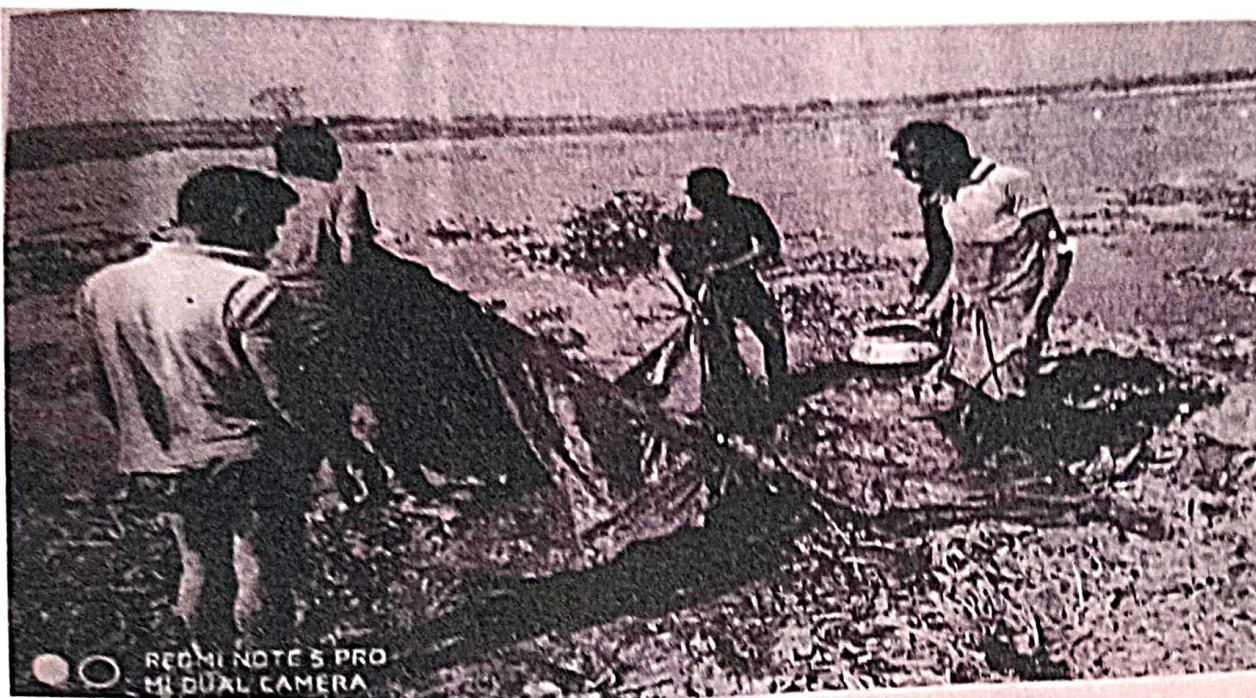
Picture :- Group Fishing of different types of local fishes by villagers.