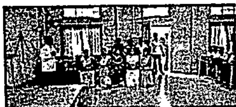
WhatsApp Image 2019-08-29 at 3.38.15 PM.jpeg 80K