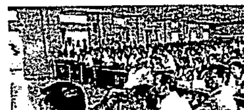
WhatsApp Image 2019-08-29 at 3.38.12 PM.jpeg 105K