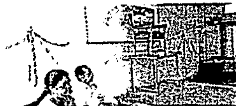
WhatsApp Image 2019-08-29 at 3.38.10 PM.jpeg 63K